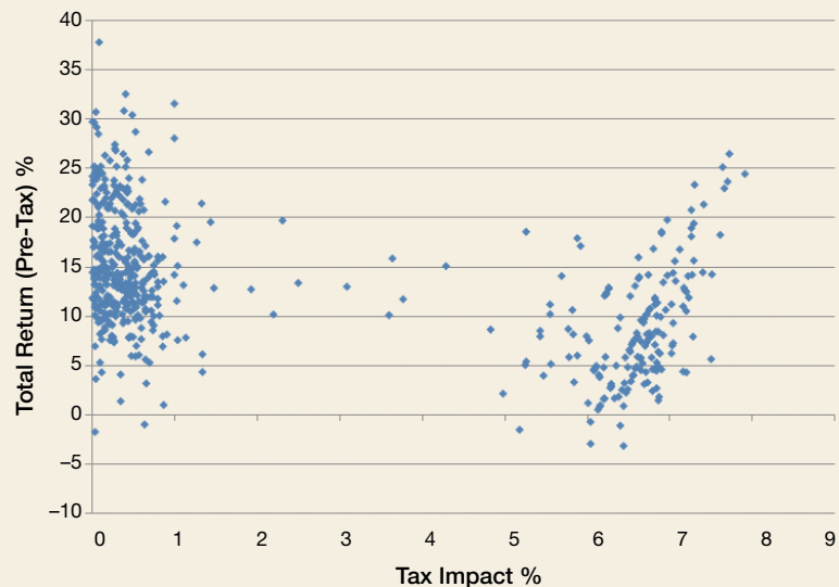
FIGURE 1: ONE IN EVERY THREE FUNDS IS EXTREMELY TAX INEFFICIENT, 12 MONTHS ENDING JUNE 30, 2010 (550 ACTIVE FUNDS)

Source: Parametric, based on Morningstar data